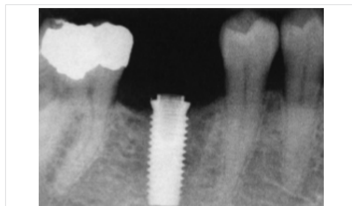
Figure 1: Intraoral Radiograph with an implant integrated with titanium that can be used as a metallic object for the calculation of root canal length.

In this case, we utilize a canal instrument (Figure 2) to calculate the real root canal length. The instrument’s length is a known value, thus, we measure its projection and that of the root canal, and through the proposed formula, we can obtain the real root canal length.